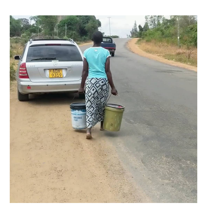
Figure 3: Women in Zimbabwe spending more time looking for water.