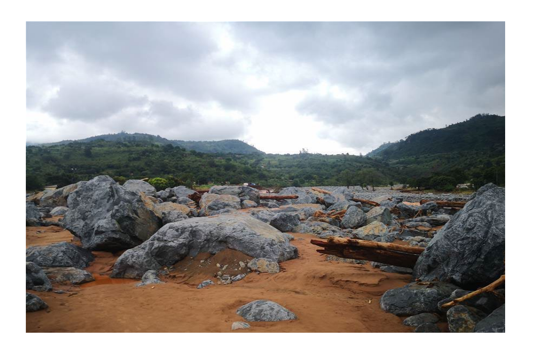
Figure 5: Roads destroyed by cyclone Idai in Zimbabwe