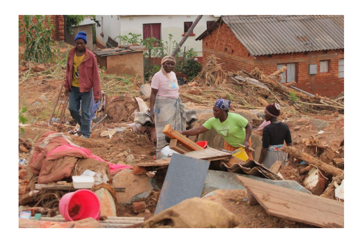
Figure 6:Homes destroyed by Cyclone Idai

The link between environmental and gender issues has always been disturbingly unsettling for me ever since I was younger. I so vividly remember the 1991- 1992 drought that hit our village. I was very young at the time. I