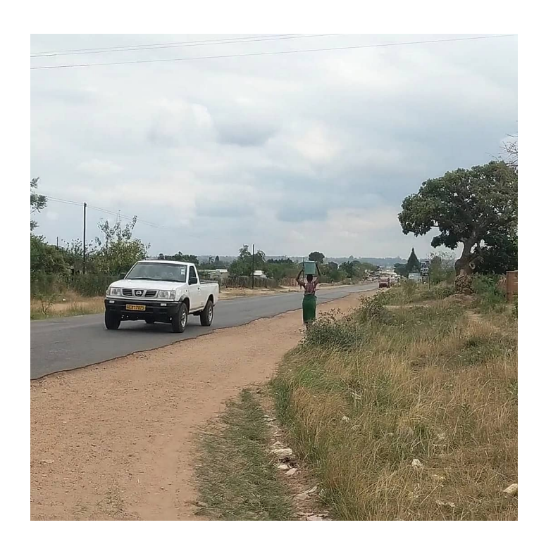
Figure 4: Women walking over 5km daily to look for water in Zimbabwe.

As a Zimbabwean, African and Methodist woman, I am honoured to be representing all women from the Global South at the 2021 COP26 in Glasgow to add our voice the Climate change issue and to find global solutions to local water issues we are facing in our communities. As a Manicaland resident I have experienced the climate change induced 1991-1992 and 2002-2003 droughts, the 2001 Cyclone Eline and others such as Idai, Eloise. In each case both too much and too little water/rain all caused massive destruction.