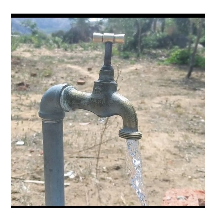
Figure 2:Clean taped water to drink

In the wake of the growing challenge of water scarcity the UN General Assembly launched the Water Action Decade on 22 March 2018 (2018-2028), to mobilize action that will help change how we manage water. Three years into the Water Action Decade and 6 years after SDGs were adopted; millions still do not have access to clean drinkable water. Covid 19 further brought to the forefront the water crisis, as the world was and is still required to wash hands with clean water and soap to help slow down the spread of the disease.