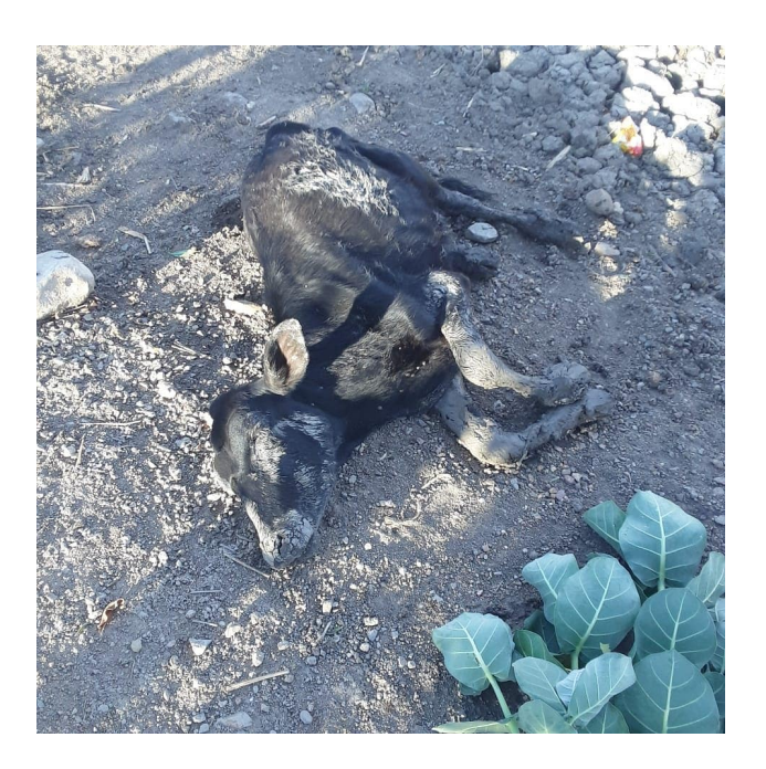
Figure 7:Cattle dying due to lack of drinking water

remember seeing our livestock dying, nearby rivers drying up and parents marrying off their young daughters in order to put food on the table.